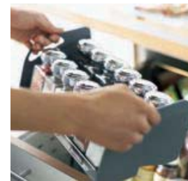
All spices have their own place in the ORGA-LINE spice holder. Its modern design ensures that it looks good – in or out of the drawer.