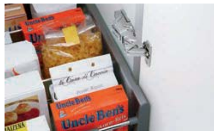
Full width inner pull-out – thanks to the CLIP top 0-protrusion hinge (no runner spacing required)