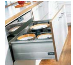
Up to 12 plates can be securely stored in the ORGA-LINE plate-holder (no tipping or sliding). An additional inner drawer behind the high front can be easily accessed via the handle.