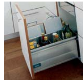
Bottles and cutting boards are stored securely. Cutting boards stand upright, the stainless steel drip tray for bottles is removable and easy to clean.

Kitchen utensils and electric appliances – everything has its place. Sharp knives are safely stored in the knife holder.